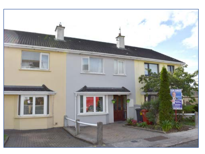
38 Ard na Corann, Midleton, Co. Cork