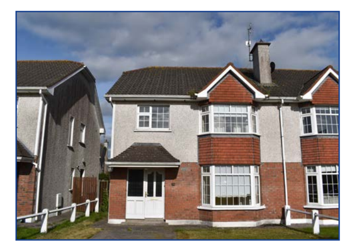
33 Willowbank Court, Midleton, Co. Cork