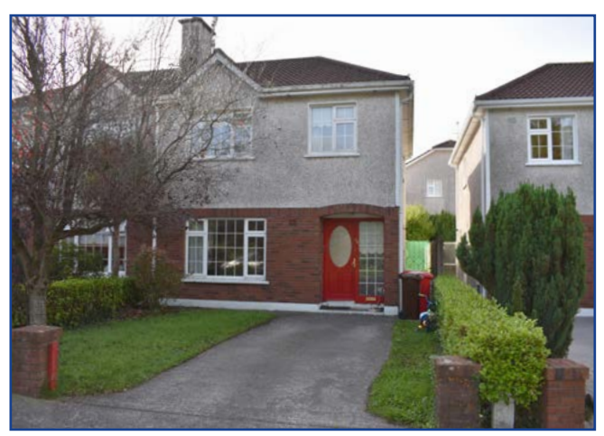
40 The Woodlands, Midleton, Co. Cork