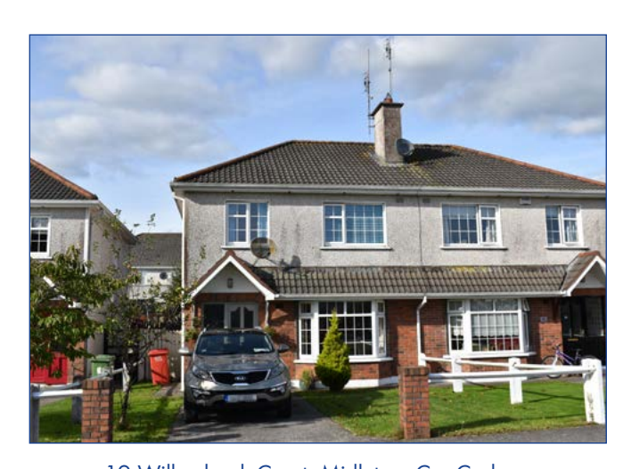
19 Willowbank Court, Midleton, Co. Cork