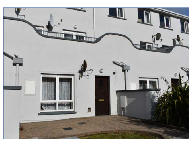
33 Ard na Corann, Midleton, Co. Cork