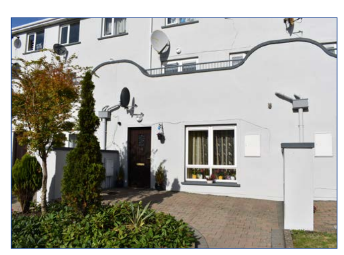
34 Ard na Corann, Midleton, Co. Cork