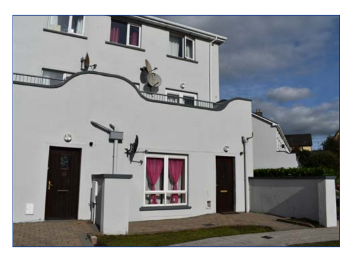
31 Ard na Corann, Midleton, Co. Cork