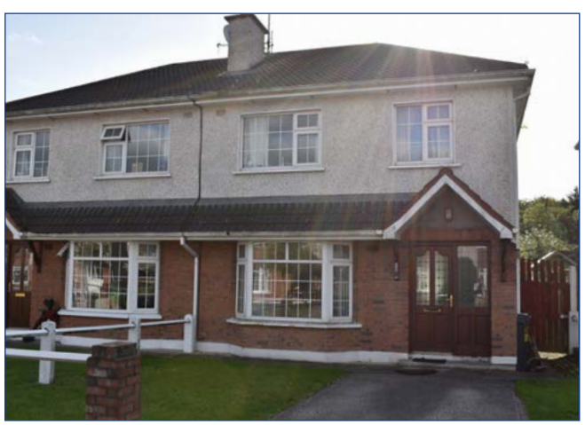
26 Willowbank Court, Midleton, Co. Cork