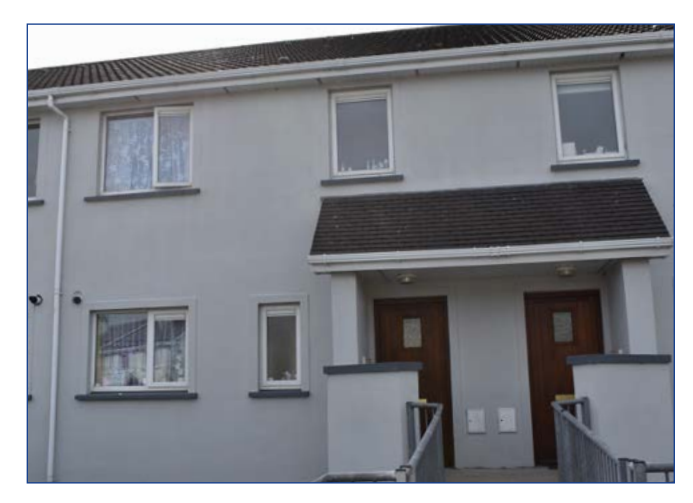
4 Ard na Corann, Midleton, Co. Cork