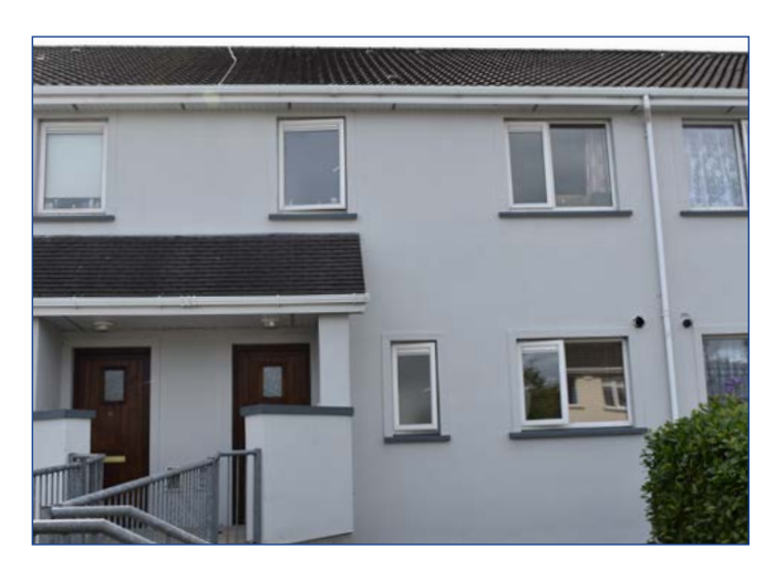
5 Ard na Corann, Midleton, Co. Cork