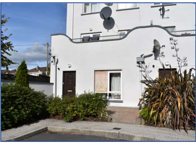
36 Ard na Corann, Midleton, Co. Cork