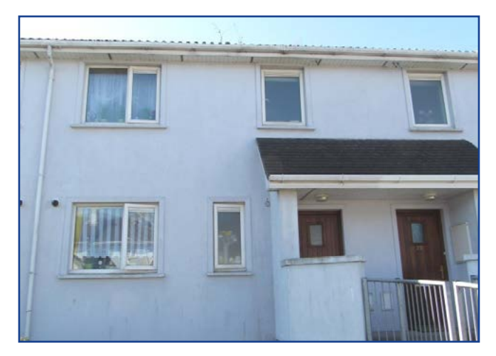
21 Ard na Corann, Midleton, Co. Cork