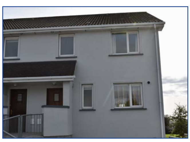
24 Ard na Corann, Midleton, Co. Cork