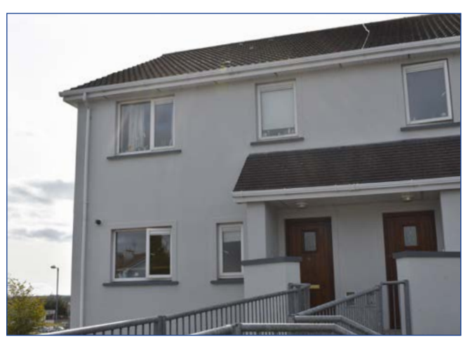
6 Ard na Corann, Midleton, Co. Cork