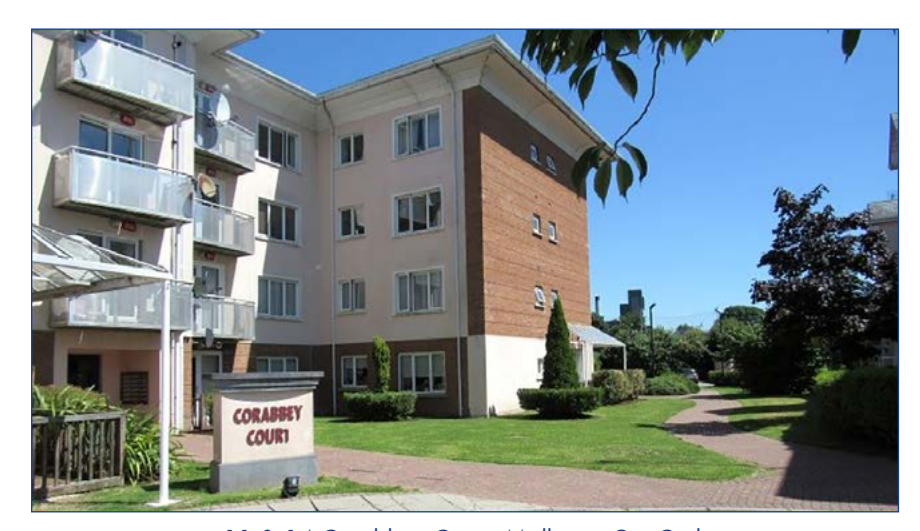
11 & 14 Corabbey Court, Midleton, Co. Cork