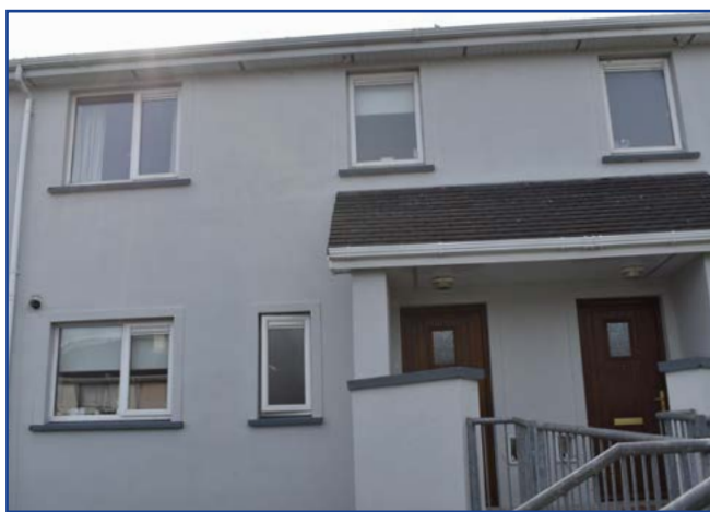
2 Ard na Corann, Midleton, Co. Cork