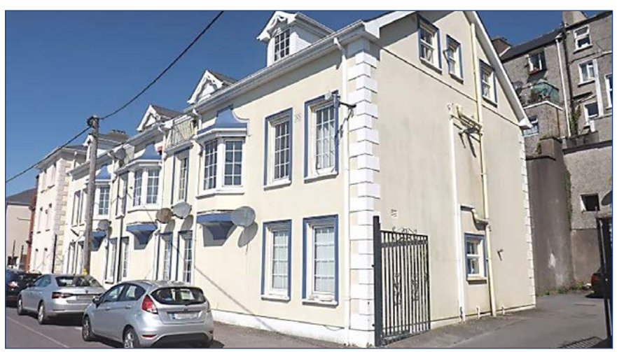
1-9 The Moorings, Cobh, Co. Cork