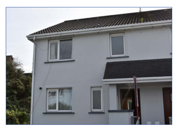
19 Ard na Corann, Midleton, Co. Cork